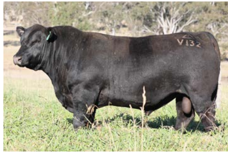
LOT 23. NBN24V132 Rambo x M Proceed