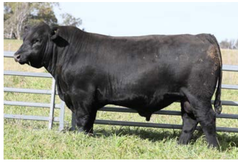
LOT 16. NBN24V113 Quinella x Ascot Global