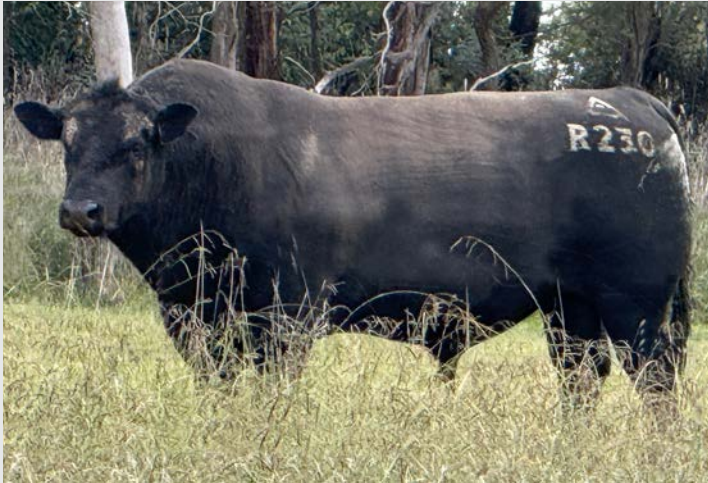
BEN NEVIS RAMBO