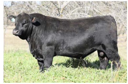
LOT 18. NBN24 V434 Quarterback x Guardian