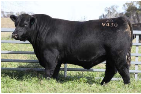
LOT 20. NBN24V430 Satisfaction x Blackbird