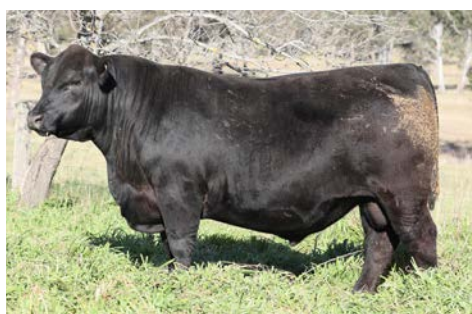
LOT 7. NBN24V119 Nutella x Infinity