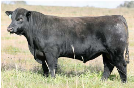
LOT 35. NBN24V213 Sunstone x Exclusive