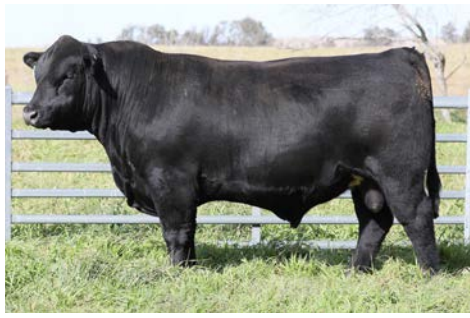
LOT 11. NBN24V74 Quinella x Beast Mode