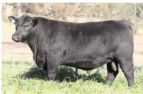
LOT 1. NBN24V86 Three Rivers x JSRL Joker