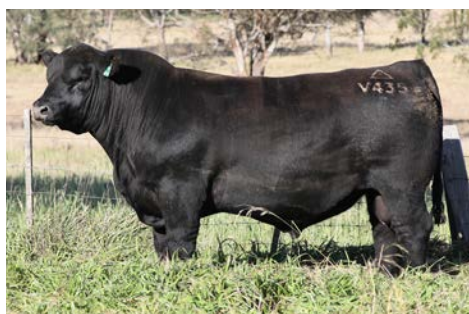
LOT 5. NBN24V435 Satisfaction x Isabel F415