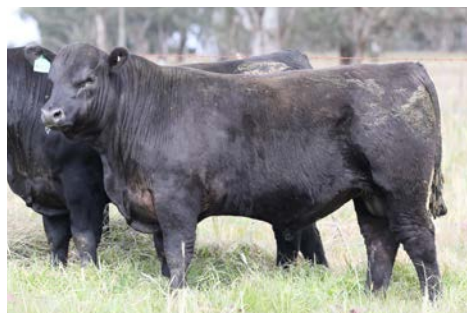
LOT 83. NBN24V314 Rambo x Pythagoras