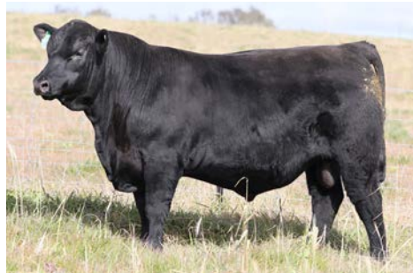
LOT 39. NBN24V350 True North x Beast Mode