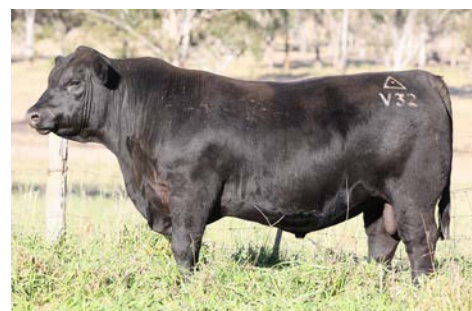
LOT 3. NBN24V32 Sunstone x Beast Mode