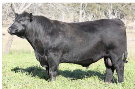
LOT 2. NBN24V447 Rambo x Full Power