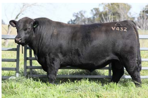
LOT 4. NBN24V432 Quinella x Command