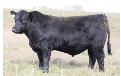
LOT 44. NBN24V205 Quartz x BN Podium