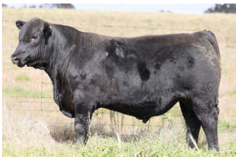
LOT 48. NBN24V475 Network x BN Monarch