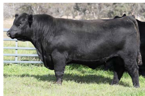
LOT 6. NBN24V431 Satisfaction x Blackbird G274