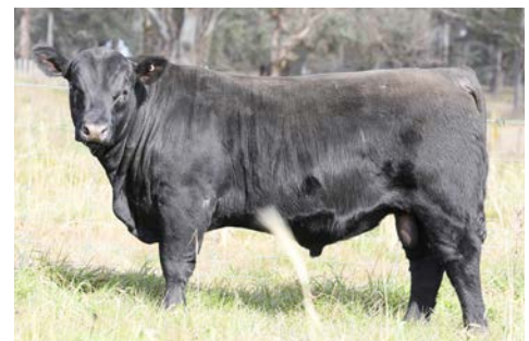
LOT 102. NBN24V241 Rambo x Paratrooper