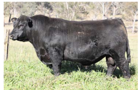
LOT 31. NBN24V439 Rocky x Braveheart