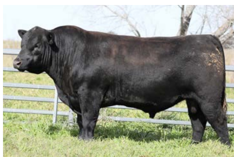
LOT 9. NBN24V26 Sunstone x Pacific