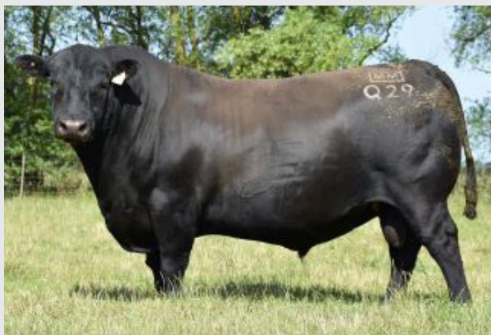
MILLAH MURRAH QUARTZ