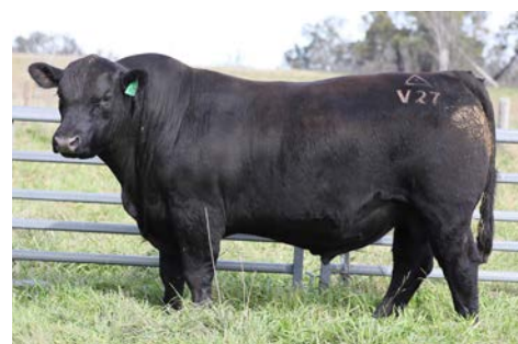
LOT 10. NBN24V27 Quinella x Quantico